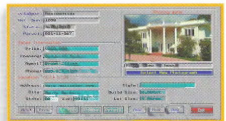
• RealVision running under DC Genesys as seen through new DC Term for Windows.

Using the DC Genesys Database tool kit, users can develop fully relational online database applications for entertainment or business. This powerful new addition to the DCN family of database communications products can be accessed through a royalty-free terminal program for Windows™ or DOS with built-in image viewing capabilities and RIPscrip compatibility. An integrated Galaticomm version of DC Genesys for The Major BBS® will be released soon.