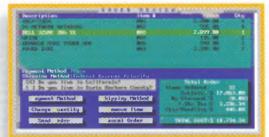
• Order Entry v1.1

The DC Order Entry add-on to the DC Net database allows you to create online product catalogs with ordering and PO generation. Order Entry is 100% configurable to meet your specific needs, including payment and shipping methods.