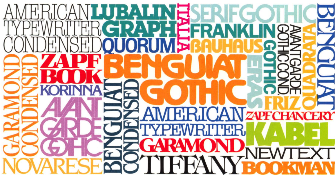
This modern typographic assemblage was designed by Herb Lubalin.

We know you often need a type disc in a hurry for a special rush job. We help you meet that need with our Type Express service. A call to our Toll-Free Type Express "hot line", plus a small premium charge, will get any one of hundreds of our standard discs out of our plant within eight business hours. And if you want overnight airfreight delivery, we'll arrange that, too. So you'll have the faces you need, when you need them.