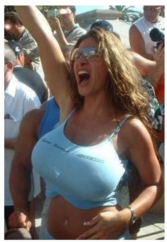
Another Boob Article by M Lloyd

OK, I'm pregnant. That's been the theme of the last few months, me being pregnant. I mentioned in the only issue of The Drink Tank worth reading, I'm horny as hell, but I've forgotten to say that I'm also bustier than ever. So much so that it's not easy to get around anymore. My breasts are now about twice as large as they were when things started. It's a terrible feeling to be trapped under your own tits, but it's also a little bit erotic.