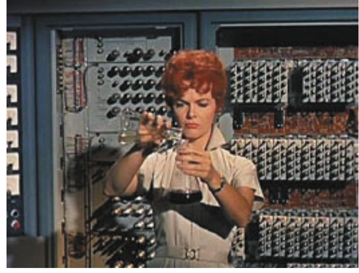
The Electrodata in The Angry Red Planet

Some films wanted a better sense of reality and used real computers for texture. Our Man Flint (Fox, 1965), starring James Coburn, features pieces of the SAGE computer and a large bank of IBM tape drives. A similar set-up was used in the time travel preparation scene in Austin Powers: The Spy Who Shagged Me (New Line Cinema, 1997). The Angry Red Planet (MGM, 1960) featured the Burroughs ElectroData computer that is currently on display in visible storage at The Computer History Museum.