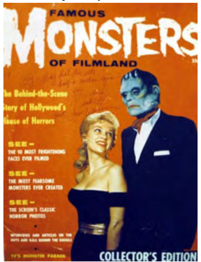
First Among Equals by Warren Buff

Whatever I am today I owe in at least some small part to you.