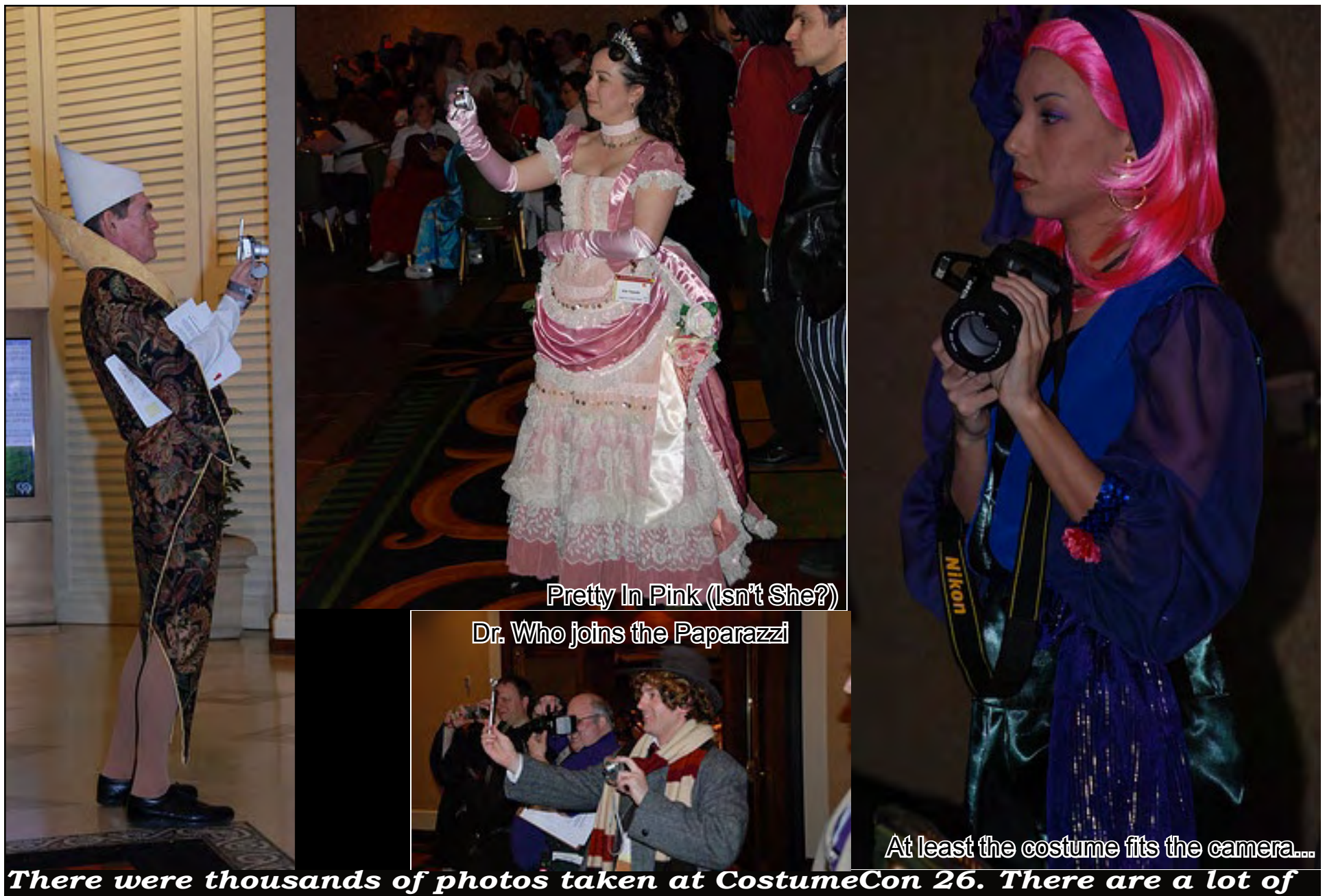
There were thousands of photos taken at CostumeCon 26. There are a lot of places you can find photos, but I suggest http://www.flickr.com/groups/cc26/as a starting point. Also, keep an eye open for http://pix.cc26.info/ which will have a ton of official con photos.