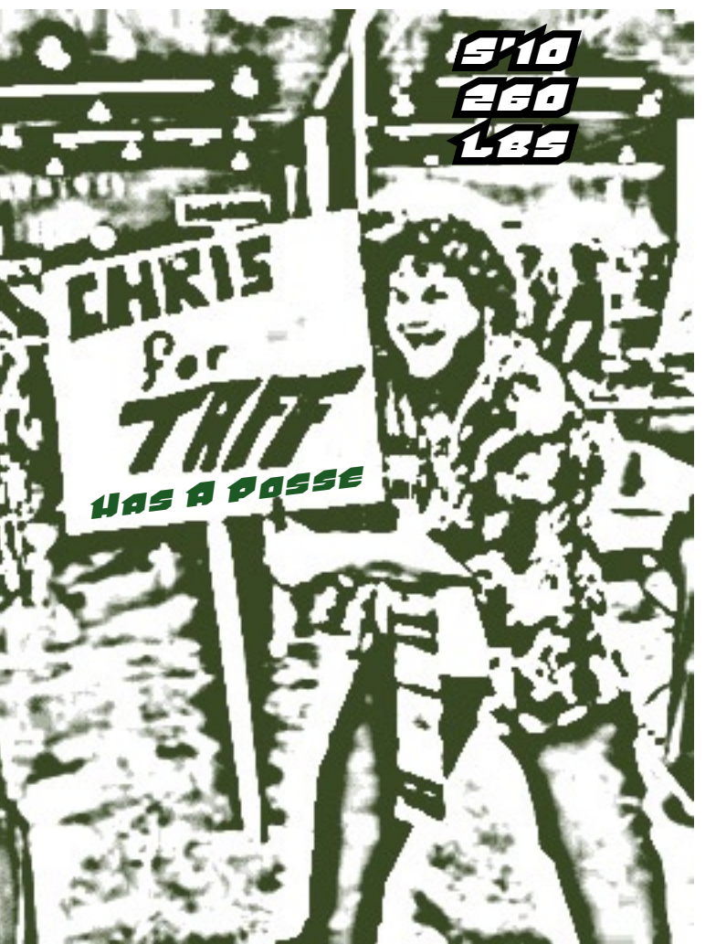
hoaxes. It's the way that old-timey Newspaper would do things!

God, but I love a good joke. Especially when it preys upon the gullibility and idiocy of the average American K-Mart shopper. It's just too easy.