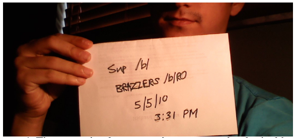
Figure 4: Timestamping lets users circumvent technological barriers to guarantee identity.

/b/ has given rise to more fluid practices to signal identity and status in spite of, or perhaps because of, the lack of technological support. Because anyone can post a picture and claim to be that person, /b/'s posters have developed a practice of "timestamping" to guarantee authenticity. To claim identity, users often take a picture of themselves with a note containing the current day and time (Figure 4).