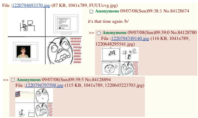
Figure 1: A "rageguy (FFFFUUUU) comic" themed thread on /b/. Source: 4chanarchive.org, where /b/ members save memorable threads.

Warren 2008), harassment and activism have often been been negatively and sensationally covered. For example, a Fox News affiliate called 4chan the "internet hate machine" (Shuman 2007). However, some media outlets have profiled the site in more nuanced ways (Dibbell 2009; 2010; Poole 2010). Much of this coverage is a response to /b/'s distinctive culture – a culture that merits critical analysis beyond the scope of this paper. Here, we focus on the board's design choices of anonymity and ephemerality, and how they may support or influence its culture.